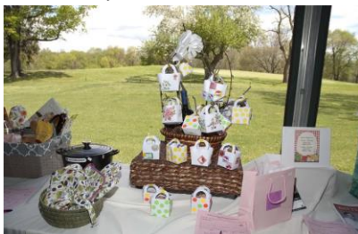
One of many beautiful auction items which helped raise money for the Foundation.